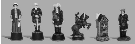
Bonnie Prince Charlie and the Jacobite rising - PA7701 - Bonnie Prince Charlie