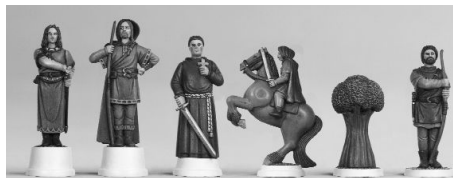
Robin Hood - PA 719 - Men of Sherwood Chess Set.

Antiquing - Should you not wish to paint the pieces using different colours you can give them an antique finish.