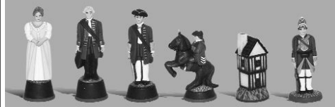
Bonnie Prince Charlie and the Jacobite rising - PA7700 - Duke of Cumberland