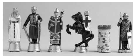
The Crusaders - PA711 - Richard the Lionheart Chess Set