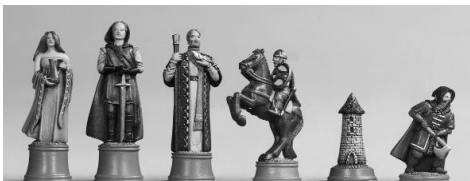
Fantasy Chess Set - PA721 Lords of the West Chess Set.