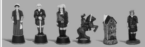
Bonnie Prince Charlie and the Jacobite rising - PA7701 - Bonnie Prince Charlie