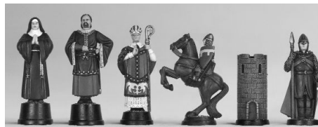
Robin Hood - PA720 - Sheriff of Nottingham Chess Set