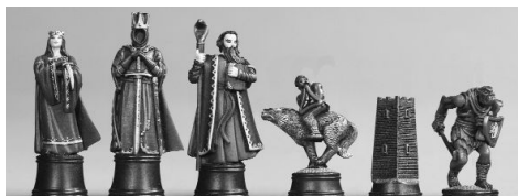
Fantasy Chess Set - PA722 Servants of the Shadow Chess Set.