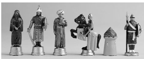
The Crusaders - PA712 - Saladin Chess Set