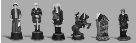
Bonnie Prince Charlie and the Jacobite rising - PA7701 - Bonnie Prince Charlie