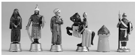
The Crusaders - PA712 - Saladin Chess Set