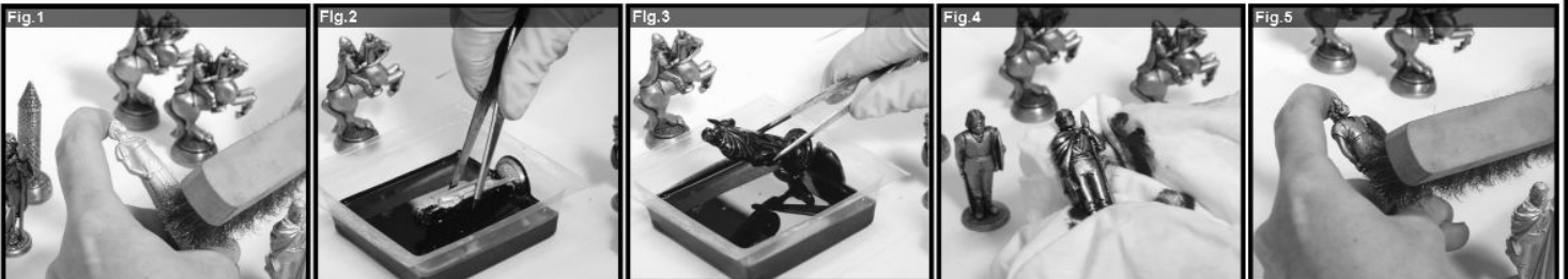
FIG.1. Polish the pieces lightly with steel wool. Be careful not to rub off any fine detail.

Antiquing - Should you not wish to paint the pieces using different colours you can give them an antique finish.