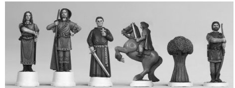
Robin Hood - PA 719 - Men of Sherwood Chess Set.

Antiquing - Should you not wish to paint the pieces using different colours you can give them an antique finish.