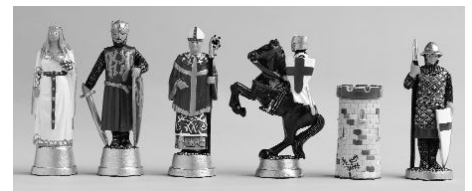
The Crusaders - PA711 - Richard the Lionheart Chess Set