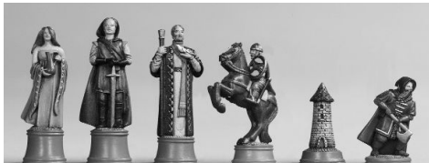
Fantasy Chess Set - PA721 Lords of the West Chess Set.