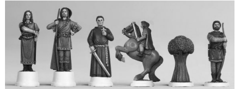
Robin Hood - PA 719 - Men of Sherwood Chess Set.

Antiquing - Should you not wish to paint the pieces using different colours you can give them an antique finish.