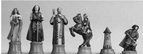
Fantasy Chess Set - PA721 Lords of the West Chess Set.