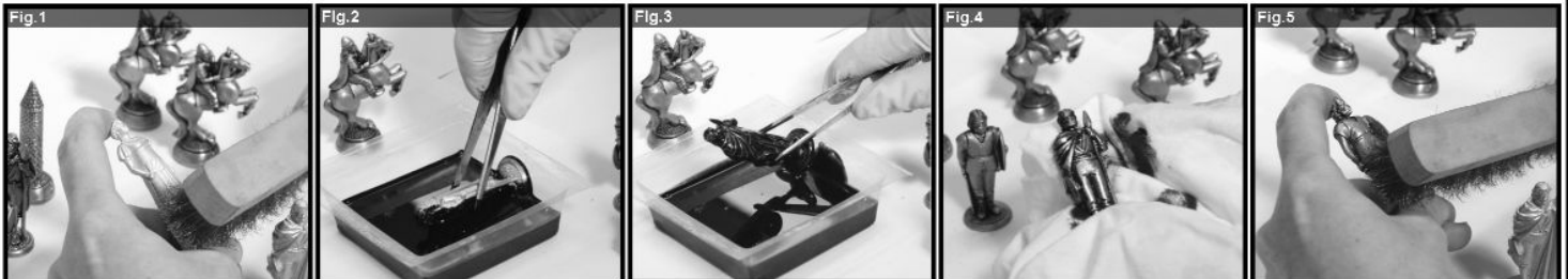
FIG.1. Polish the pieces lightly with steel wool. Be careful not to rub off any fine detail.

Antiquing - Should you not wish to paint the pieces using different colours you can give them an antique finish.