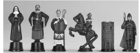
Robin Hood - PA720 - Sheriff of Nottingham Chess Set