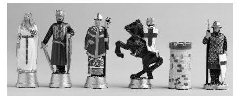
The Crusaders - PA711 - Richard the Lionheart Chess Set