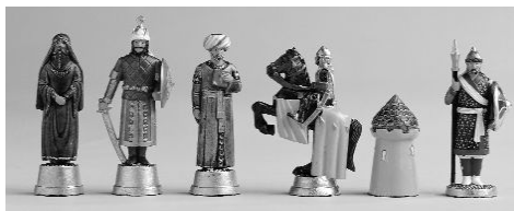
The Crusaders - PA712 - Saladin Chess Set