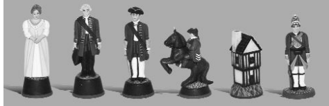
Bonnie Prince Charlie and the Jacobite rising - PA7700 - Duke of Cumberland