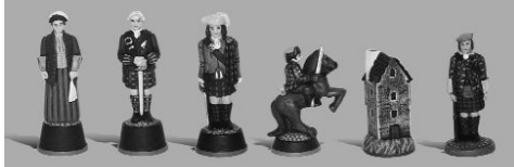
Bonnie Prince Charlie and the Jacobite rising - PA7701 - Bonnie Prince Charlie