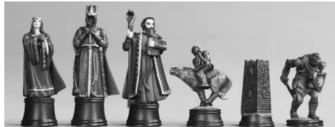
Fantasy Chess Set - PA722 Servants of the Shadow Chess Set.