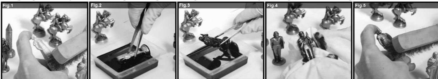
FIG.1. Polish the pieces lightly with steel wool. Be careful not to rub off any fine detail.

Antiquing - Should you not wish to paint the pieces using different colours you can give them an antique finish.