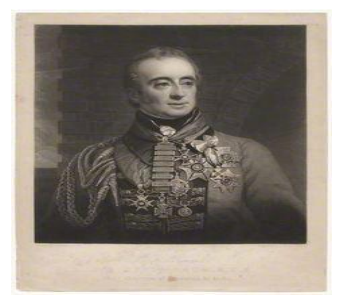
3. Irish Waterloo generals (i): Major General Sir Denis Pack.