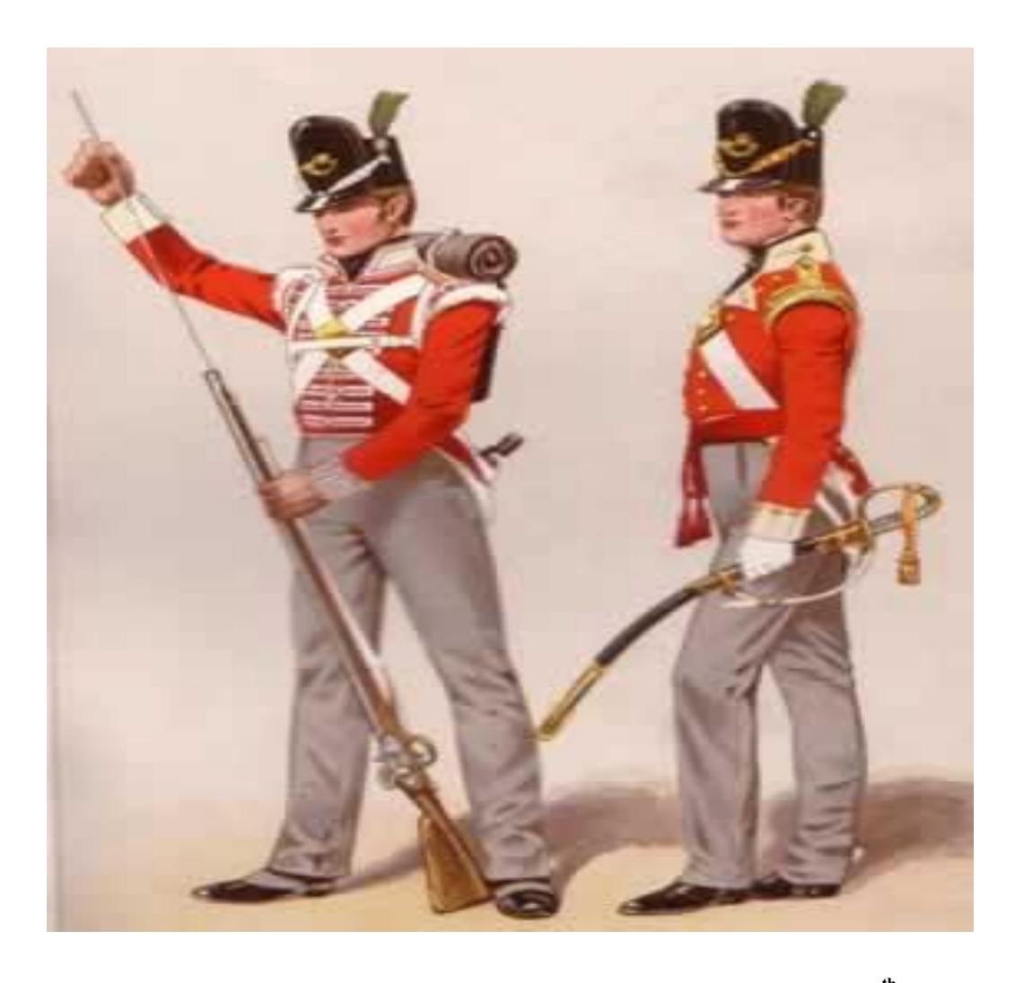
2. Irish soldiers of the British army: private and officer, light company, 27<sup>th</sup> (Inniskilling) Foot, c. 1812-16. The infantry uniform depicted is that worn during the Waterloo campaign.